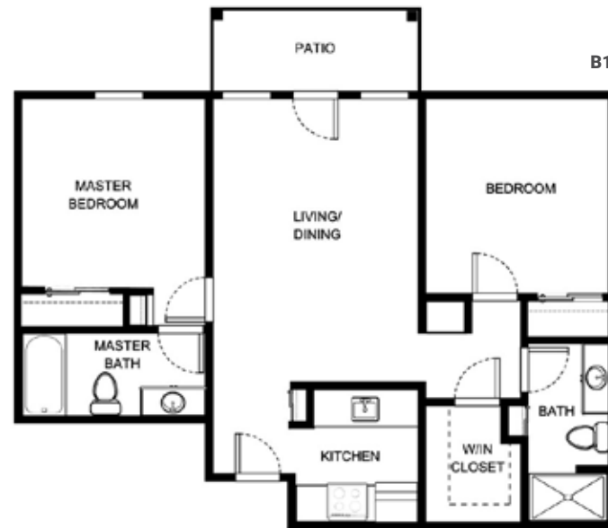
TWO BEDROOM 950 sq. ft