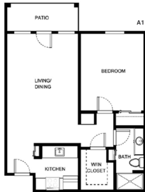
STUDIO 750 sq. ft

6711 Embassy Blvd, Port Richey, FL 34668 | 727-849-9335 | regencyresidenceskyactiveliving.com